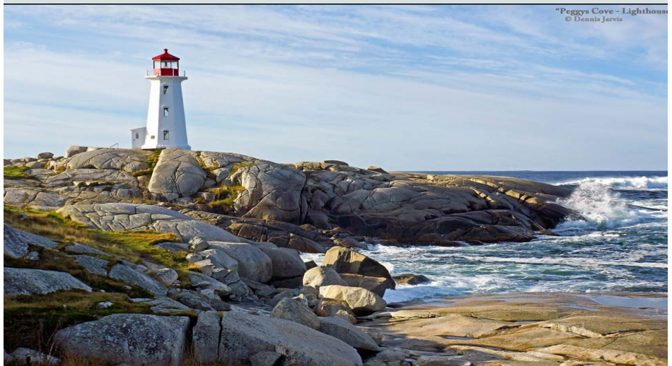
"Peggy's Cove - Lighthouse"

With Royal Caribbean International®, you'll discover the unmistakable charm of New England and eastern Canada. A distinctive history and natural beauty (much like yourself we imagine) gives the region an alluring appeal. There's no better time to visit than the fall. The foliage is brilliant in every imaginable color, lighthouses dot the coastline, and there's always an authentic lobster bake to be savored! Lobster bibs included.