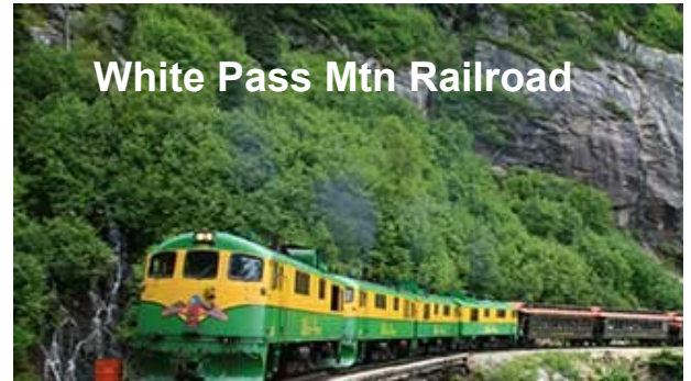
White Pass Mtn Railroad