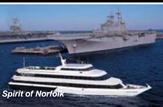
Spirit of Norfolk